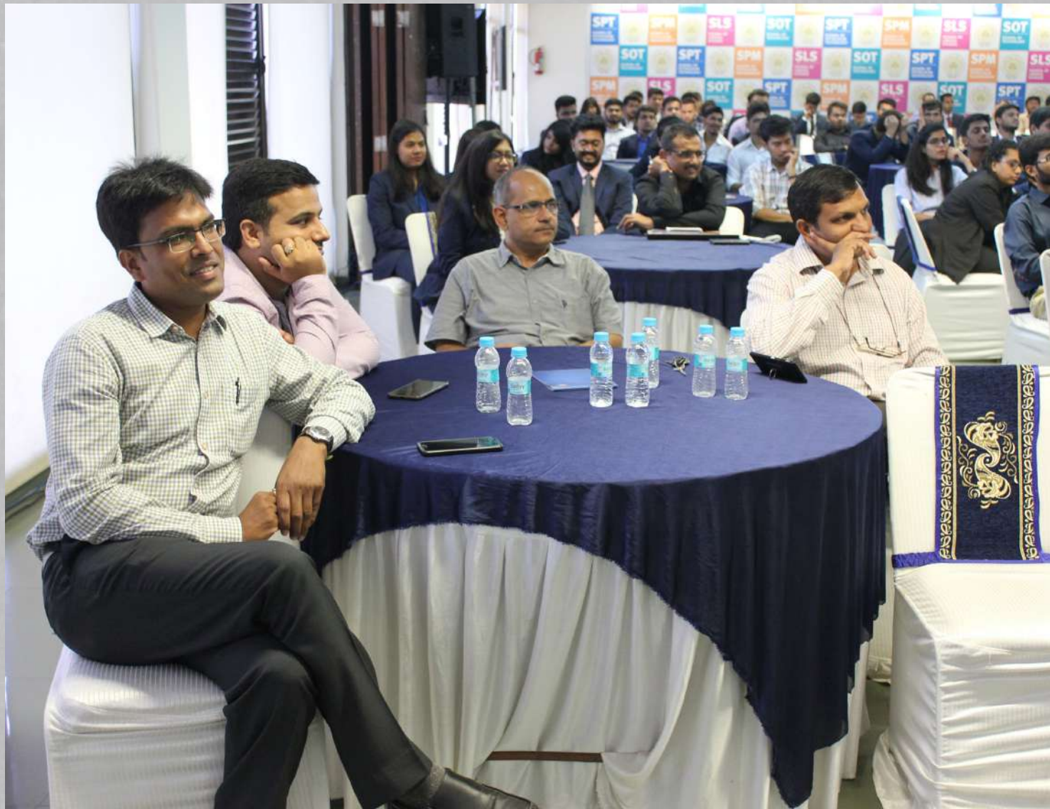
A still from Track 4: Samavesh 2018