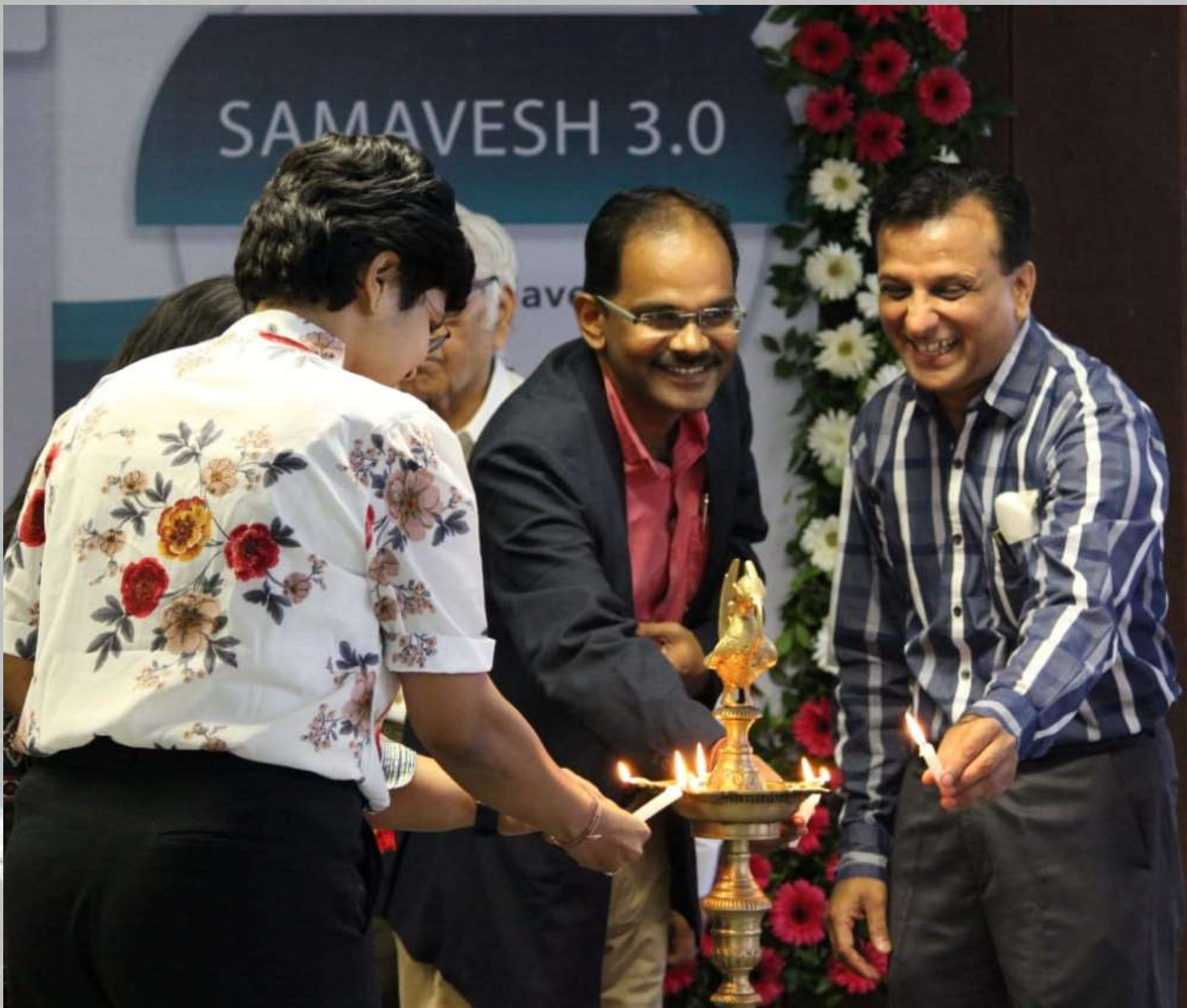
A still from Inaugural Ceremony: Samavesh 2018

Pandit Deendayal Petroleum University, Gandhinagar is a NAAC (3.39) accredited, UGC recognized university. The University under the presidentship of Dr. Mukesh Ambani, has been offering various academic and research programmes at undergraduate, postgraduate and Ph.D. level. The university is well known for training competent leaders for the business world.