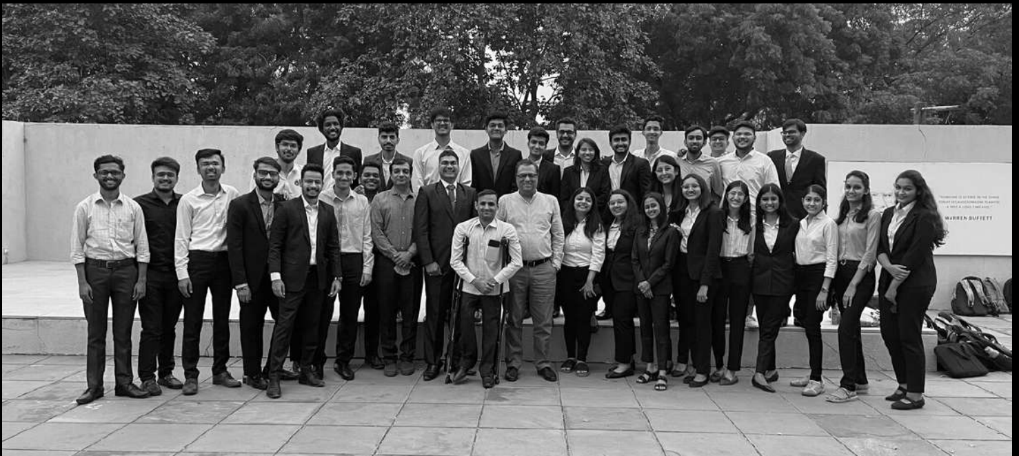
Team BMS - 2021