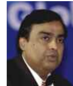
Dr. Mukesh Ambani President Pandit Deendayal Petroleum University

Pandit Deendayal Petroleum University (PDPU) has been conceived as a world class educational institution in Oil & Gas and allied Energy Sectors. Modeled on the IITs & IIMs, PDPU will create a vibrant brigade of knowledge leaders in the energy sector. This University is coming into being at a crucial juncture when a major transformation is taking place in the global energy industry. These changes are impacting all areas in the energy sector : finance, administrative regulations, tax, and marketing and information technology. The need of the hour is for professionals who can cope with this transformation. I hope this university will meet India's growing need of such professionals of world class excellence and expertise. Such an energy-focused university will enable India change her economic and social landscape dramatically.